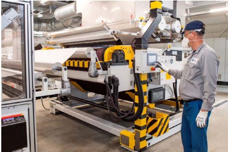
Photo: Dutch PPE Solutions are now producing meltblown filter material in the Netherlands using Borealis Borenewables™ polypropylene (PP).

their sustainability goals while maintaining the existing quality standards of their products, which is in the true spirit of EverMinds.”