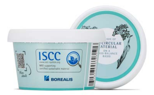
Photo: New prototype in-mold labeling cup produced by Greiner Packaging, made of renewable (bio-circular) polypropylene from Borealis (Bornewables™).