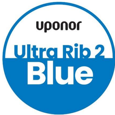
Image: Ultra Rib 2 Blue logo by Uponor.