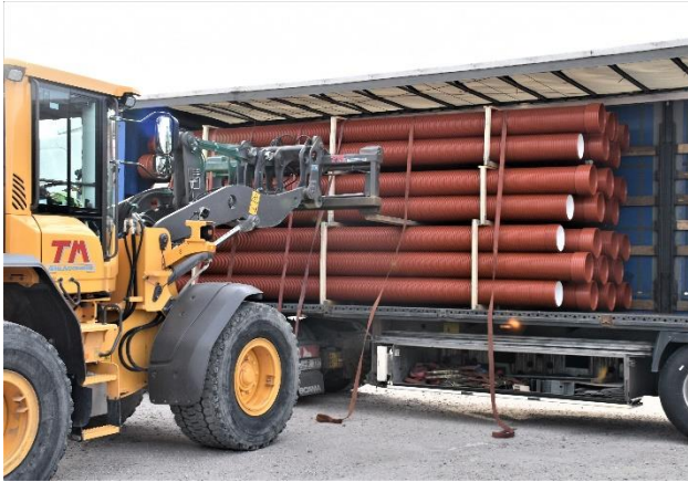
Photo: Ultra Rib 2 Blue delivered to its first customer in Sigtuna, Sweden.

Photos: Publication free of charge, sample copy/Internet link appreciated