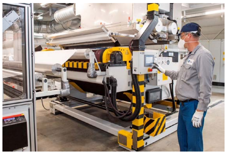
Photo: Dutch PPE Solutions are now producing meltblown filter material in the Netherlands using Borealis Bornewables™ polypropylene (PP).

their sustainability goals while maintaining the existing quality standards of their products, which is in the true spirit of EverMinds."